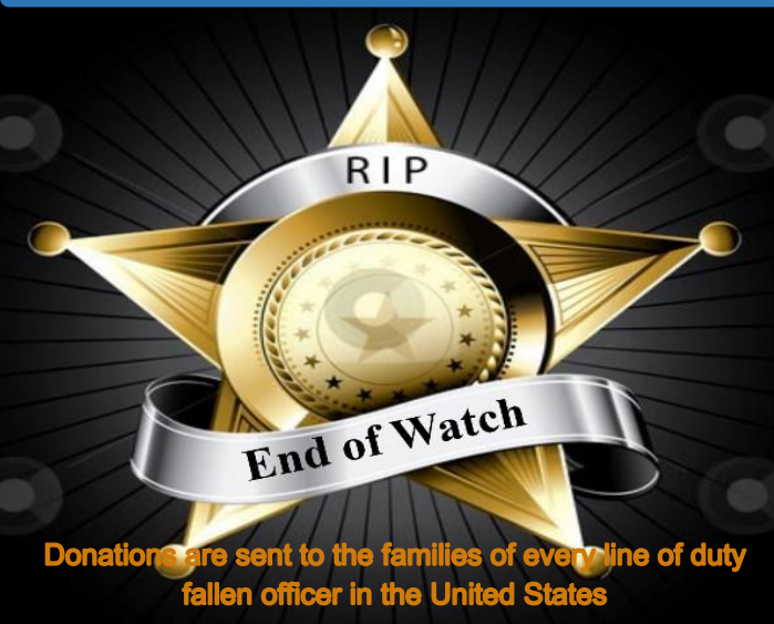
Donations are sent to the families of every line of duty fallen officer in the United States