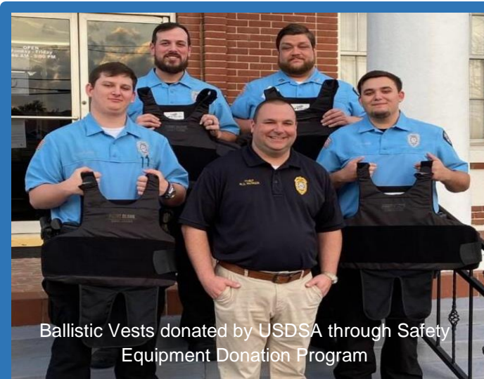
Ballistic Vests donated by USDSA through Safety Equipment Donation Program